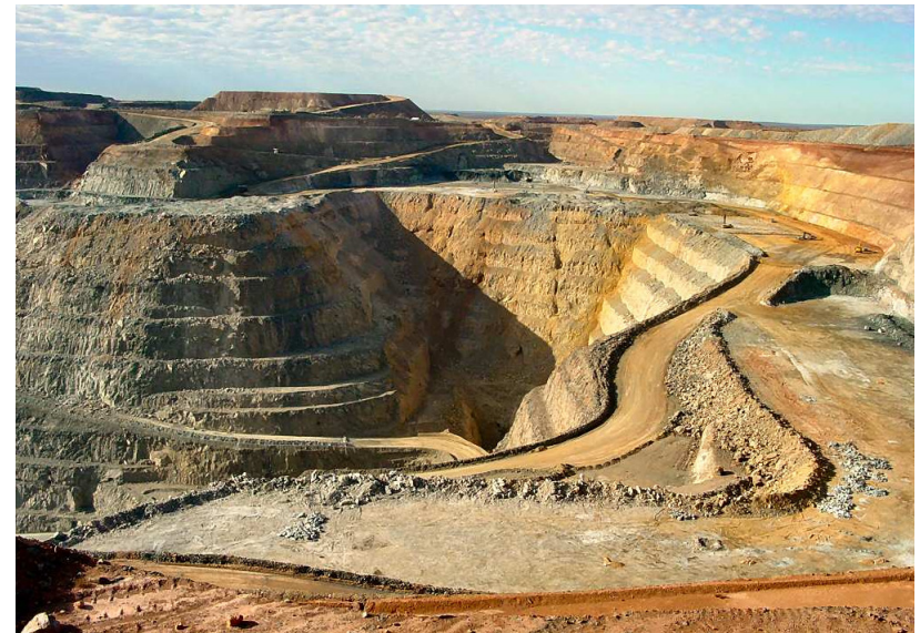
Kalgoorlie's Superpit gold mine

So folklore and dreamtime stories have grown up about these places – like the story about Jabiru uranium areas that should not be disturbed 'because giant green ants will come out of the ground to consume you'.